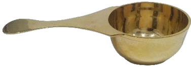
Oil Bowl with Handle