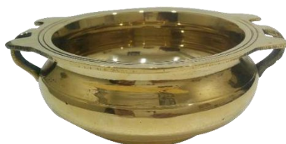
Polished Uruli 9" Dia.