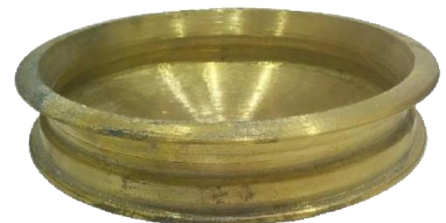
Unpolished Uruli 12" Dia.