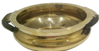
Polished Uruli 5" Dia.