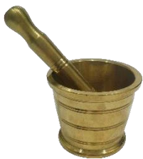
Mortat & Pestle