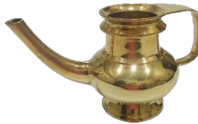
Kindi with Handle